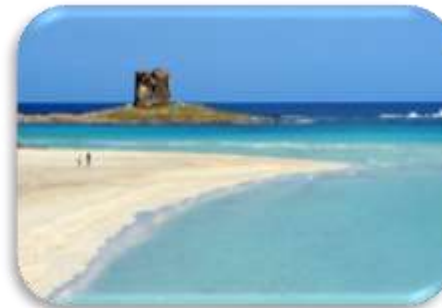
La Pelosa beach - Stintino