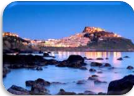
Castelsardo by sunset

DAY 5. Staying anchored outside Marinedda bay you can take the opportunity for a surfing course or session on the beach. There is a quite well known school. Enjoy the sea. If you prefer we can easily organize a beauty treatment on board. Aquafantasy park for kids just up on the hills 1 km away. From Isola Rossa, only 20 min away by car, you can visit the Ethnographic museum in Aggius (typical medieval village inland of Gallura) and have a typical dinner in l'Agnata.