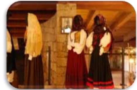
Ethnographic Museum in Aggius

DAY 6. Back to Alghero for guests departure.