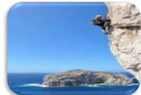
Climbing Capo Caccia