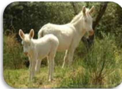
White donkey in Asinara island